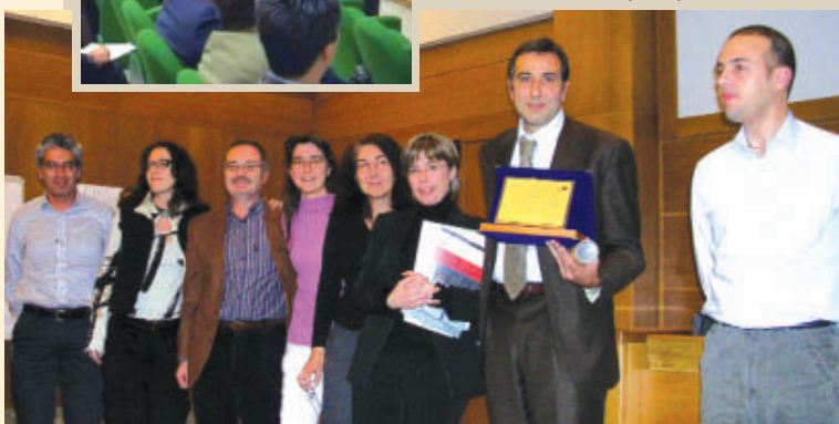
A team from Ericsson Marconi was awarded the Project Management Office Award 2008 by the PMI Northern Italy Chapter.

awarded the Project Management Office 2008 award to Ericsson Marconi.